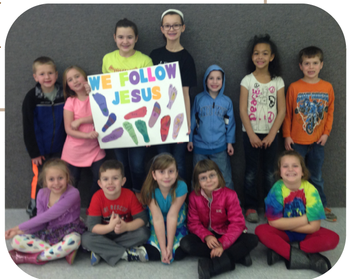
1st grade PSR students in Antwerp and their classroom helpers decorated their footprints with ways they can follow Jesus.

National Directory for Catechesis pg 234