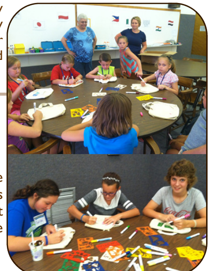
Adults, middle school students, and high school students volunteer their time to help out in the crafts station at Vacation Bible School in July of 2016.

There is a need for adults in their 20s, 30s, and 40s to step up and become Eucharistic Ministers and Lectors in the parish. Please prayerfully consider this ministry!