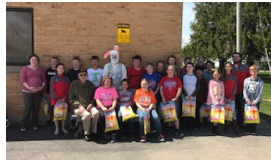
EASTER EGG HUNT PAGE 2