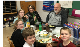
BOOK FAIR GUEST LUNCH - THANK YOU! PAGE 2