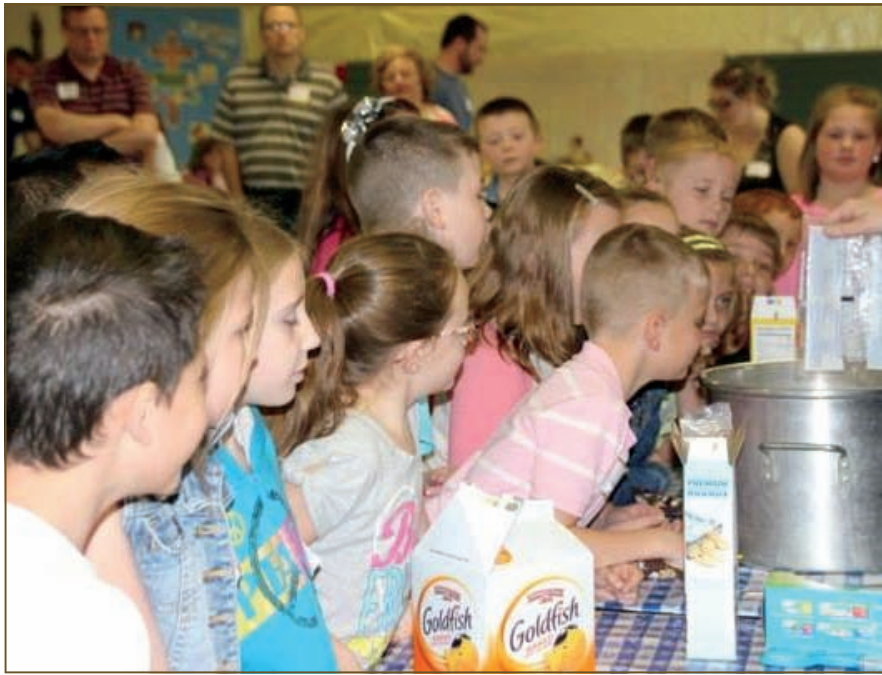
2nd grade students and their parents participate in an activity at the First Communion retreat, April 18, 2015

Discipline Policies Our main concern is to maintain a safe environment in which our youth can form a community, share faith, and enjoy the best possible learning environment. Therefore, our students must meet the following expectations: