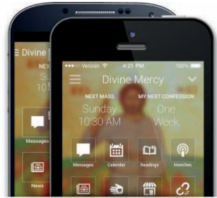
To download our app, visit myparishapp.com

Information about last minute cancellations can also be found on channel 21 Alive from Fort Wayne or by calling the parish office.