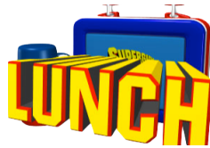
GUEST LUNCH NEXT WEEK PAGE 2