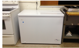
NEW HALL FREEZER PAGE 2