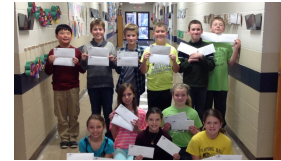
CLASSROOM CURRICULUM NEWS PAGE 3