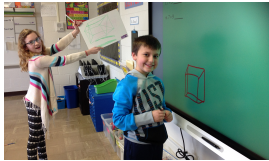
CLASSROOM CURRICULUM NEWS PAGE 2