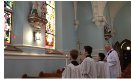
STATIONS OF THE CROSS PAGE 3