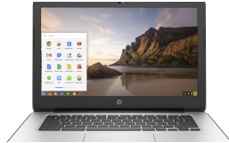
TECHNOLOGY UPDATE PAGE 3