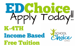
EDCHOICE SCHOLARSHIP APPLICATIONS PAGE 4