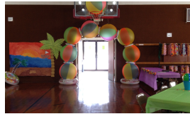
SCHOOL DANCE PICTURES PAGE 2