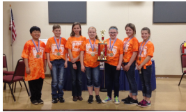
BATTLE OF THE BOOKS CHAMPIONS PAGE 2