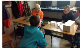
CLASSROOM CURRICULUM NEWS PAGE 3